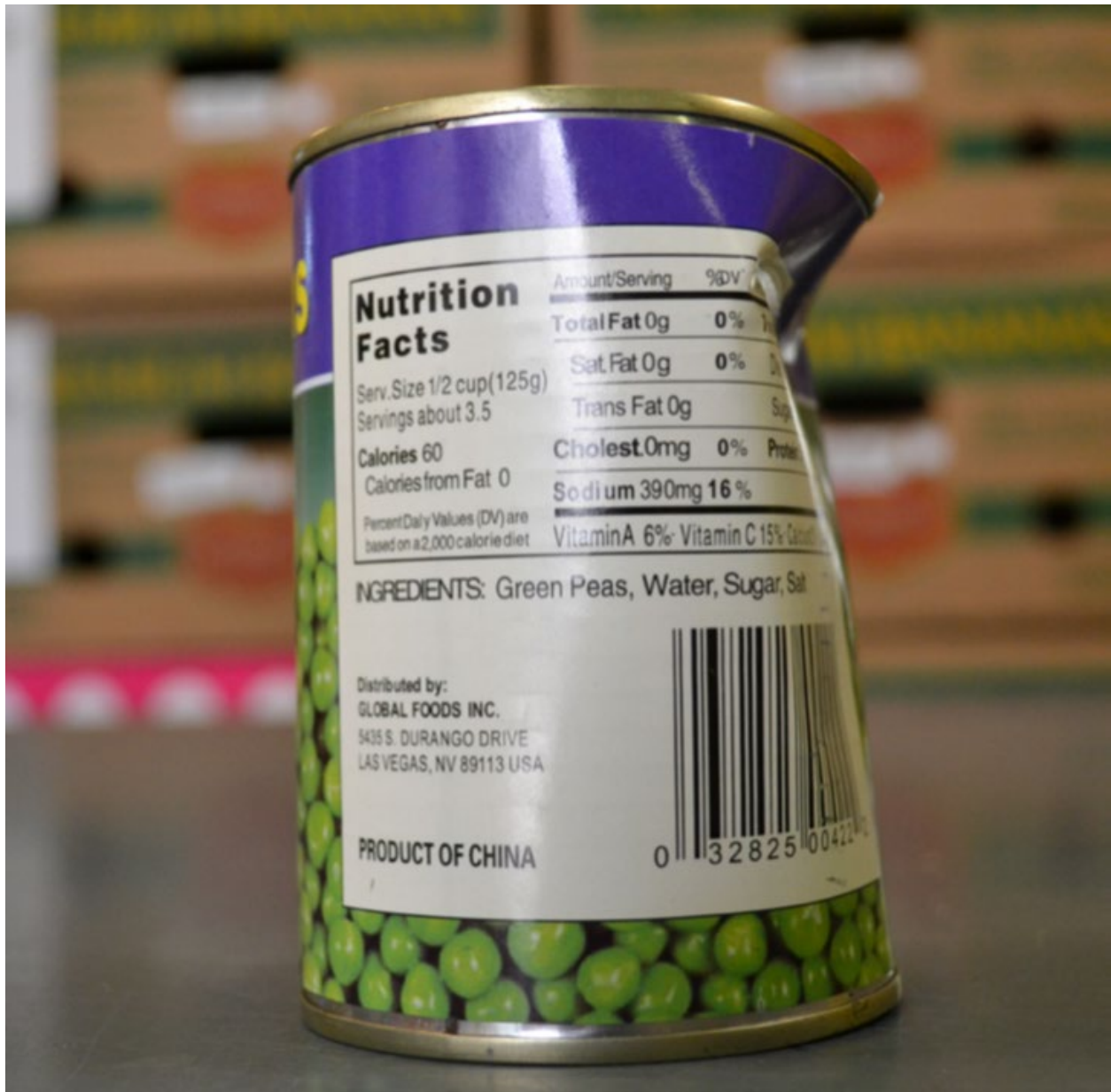
Metal touching metal/crimped over