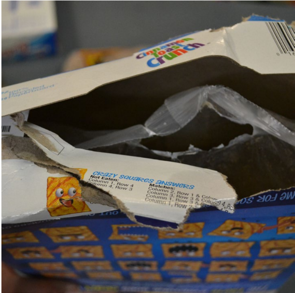
Torn inner package