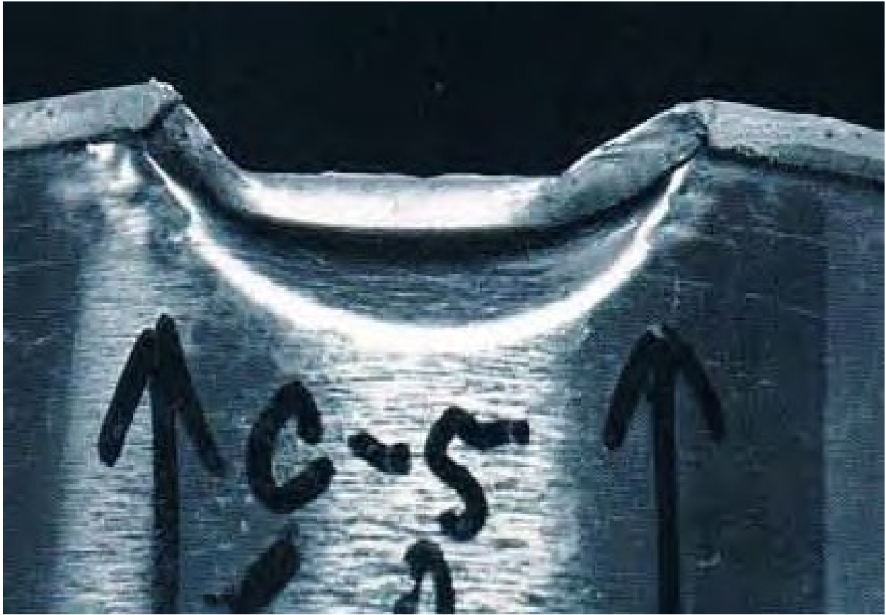
Severe double seam dent plate fracture