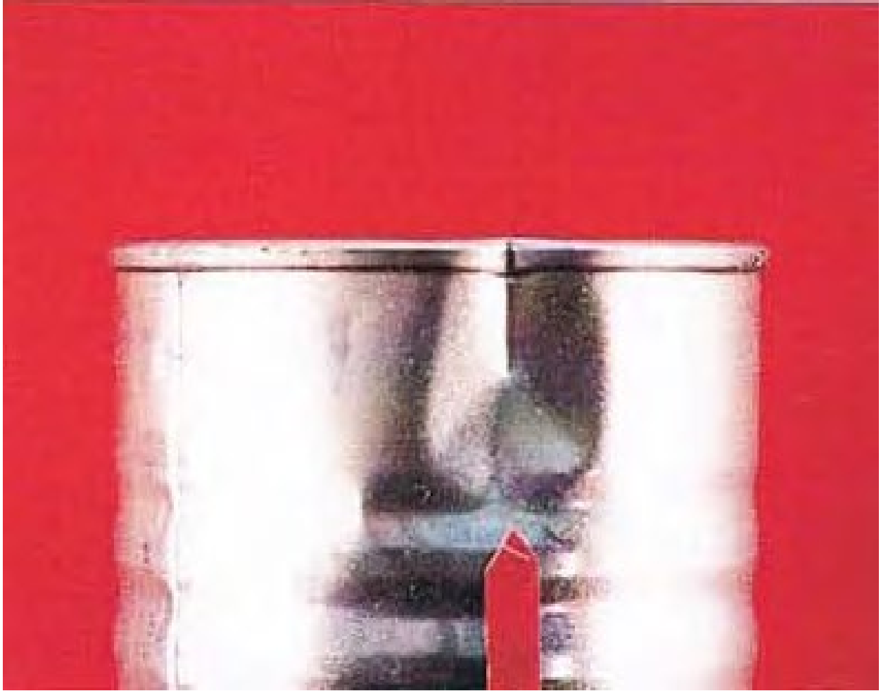
Plate fracture in double seam or can body